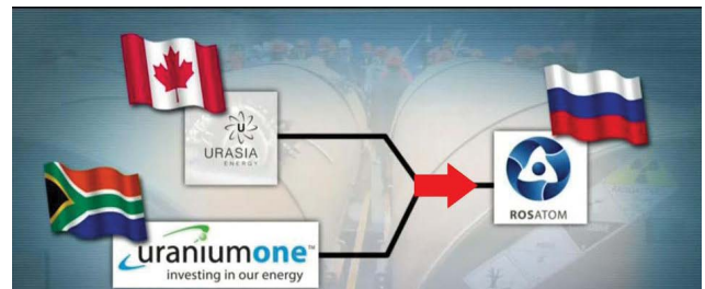
Figure 1: History of Uranium One.

Russian and Chinese interests are also involved in North American uranium exploration, mining, and processing and milling. Russia, through Uranium One, a uranium holding company, once funded by the South African Stock Exchange (Figure 1), was purchased along with a Canadian company (Urasia Energy), both now controlled by Russian government nuclear monopoly, the history of Rosatom [15]. Uranium One, is on various stock exchanges as a subsidiary of Rosatom .