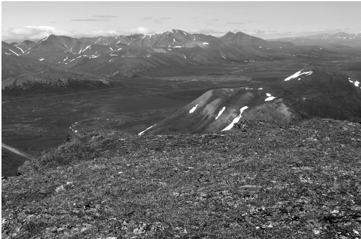
View of Salmon Lake and the eastern Kigluaik Mountains, central Seward Peninsula

Pamphlet to accompany Scientific Investigations Map 3131